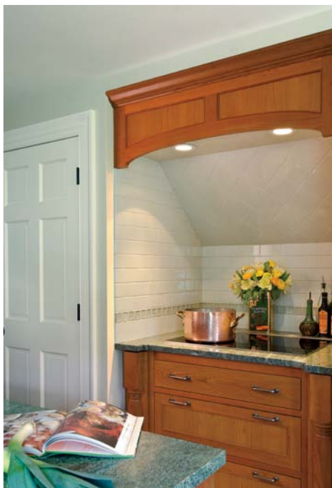
(Above) Utilizing a nook under the staircase, the cooking grotto houses storage for pots and pans, and two pull-out spice units. The induction cooktop is vented via a downdraft unit.