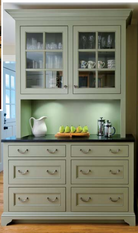
(Right) A custom designed sideboard and hutch top is used to store silver, dinnerware, and function as a beverage station.

By implementing three wood finishes throughout the space with free-standing, furniture-like pieces, the design team was able to maintain the flavor of an English Country kitchen with elegance and refinement, seamlessly complementing the style of the Royal Barry Wills' Cape architecture.